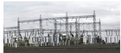
Sub-Station / Switch Yard Structures