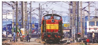
Railway Electrification Structures