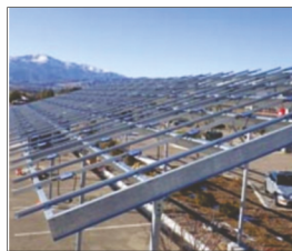
Module Mounting Structures (MMS)