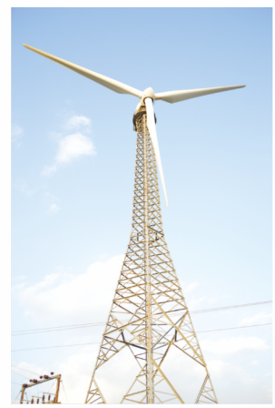
Wind Mill Towers