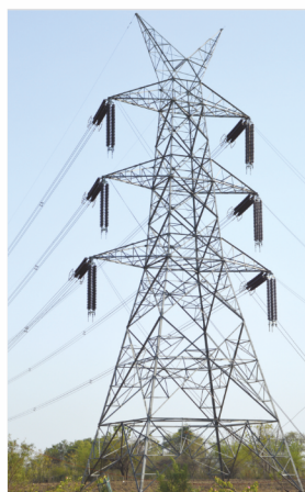
All Types of Transmission Line Towers